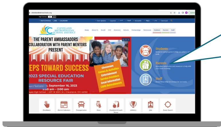
Cleveland Metropolitan School District