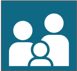
Foster Care/ Kinship Care

Students are more successful if they have one caring adult in their life, make sure a child in foster care or kinship care has a mentor in their school that they can lean on if needed.