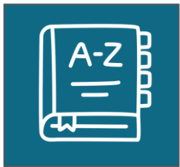
Non-English Learners/Migrant Families

I have separated the vulnerable populations of Ohio because I believe these are the populations that need the most help and teachers will help the most! I feel this will make it easy for both the parents and teachers to reach the resources needed.