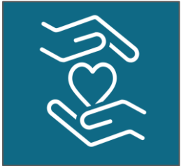
Students with Disabilities

Contact your student's case manager. If still need help contact the Special Education Coordinator/Director - name and email here