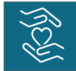
Students with Disabilities

When you click each button, the resources in the following slides are great Tier I information - meaning it is for ALL parents, students and staff.