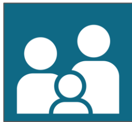
Foster Care/ Kinship Care