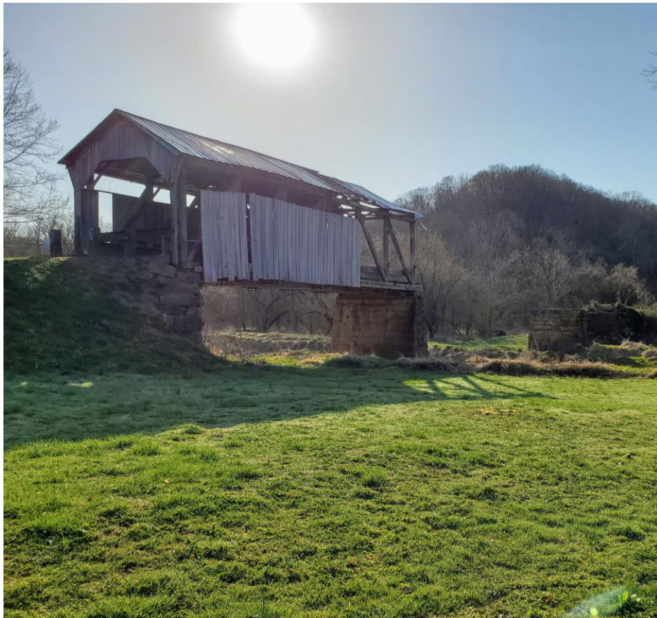
Knowlton Covered Bridge, Rinard Mills, OH, SST 16